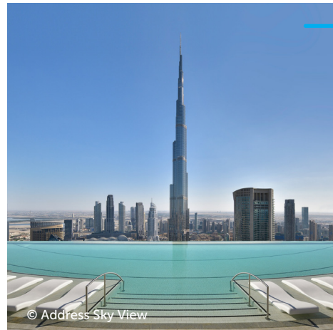
Address Sky View Dubai (UAE)