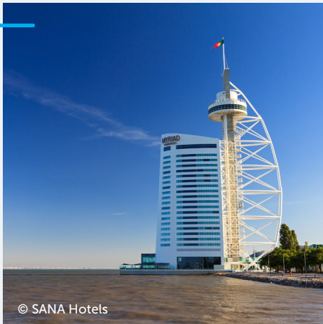
Myriad by SANA Hotels Lisbon (PT)