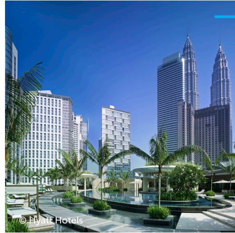
Grand Hyatt Hotel Kuala Lumpur (MY)

At CDM Stravitec, we take pride in the quality of work that we produce. Since the founding of our company in 1951, we have made many contributions to the intelligent design and noise mitigation of swimming pools, spas, and the mechanical components with our engineered products. Take a look at some of our latest projects carried out with well-known brands and reputable acoustical consultants.